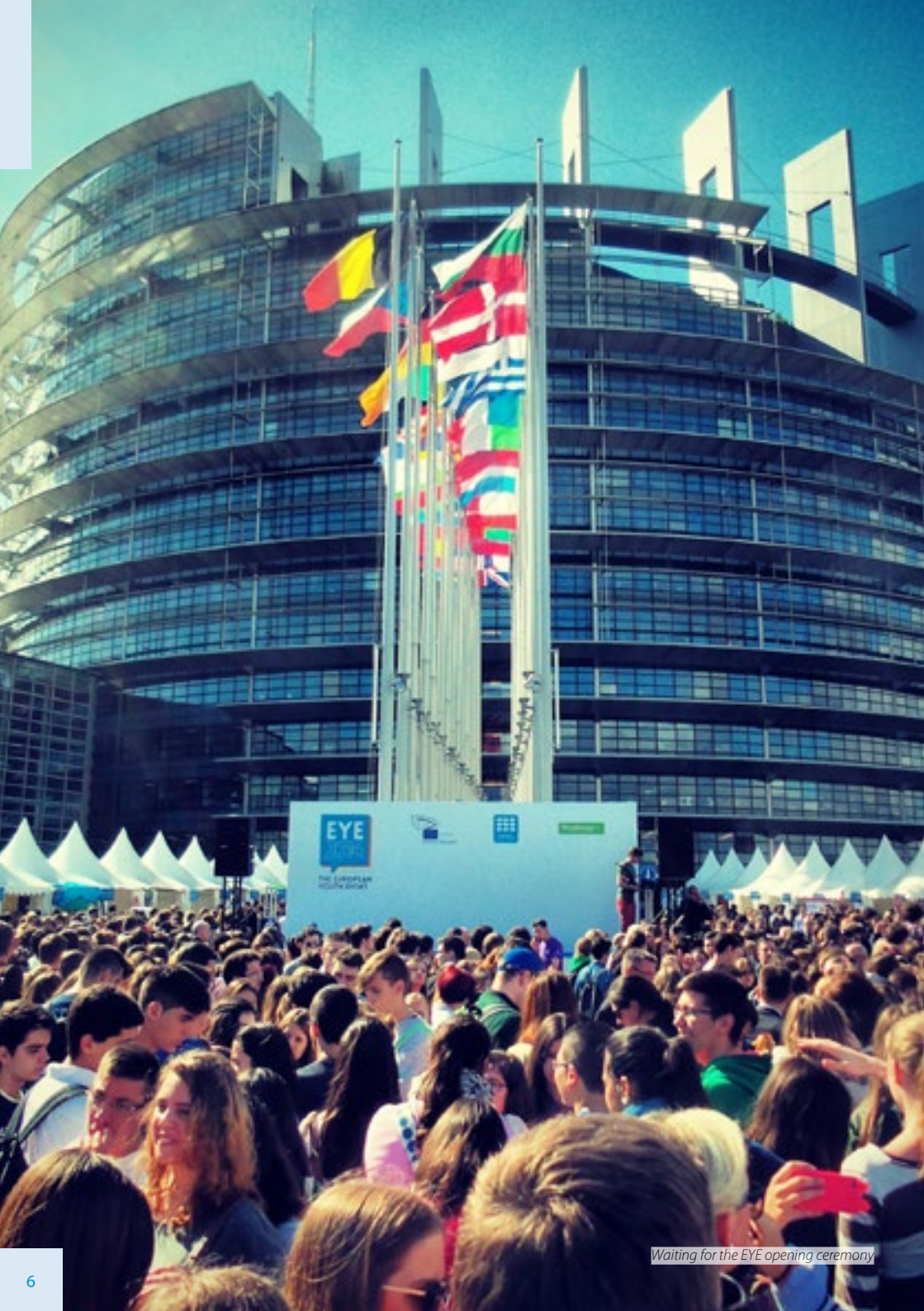
Waiting for the EYE opening ceremony