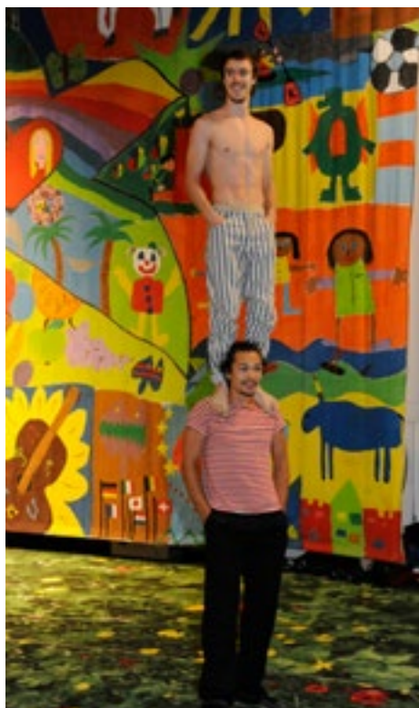
Two young artists performing in the circus show

“All of the problems we have with discrimination, I think we can solve by educating people; it’s all about not having enough knowledge. We have to educate people so that they understand what an immigrant actually does, so that people don’t buy into the propaganda - that immigration is all about us gaining or losing money - because it’s about so much more. Immigration is also about gaining or losing culture - mainly gaining”.