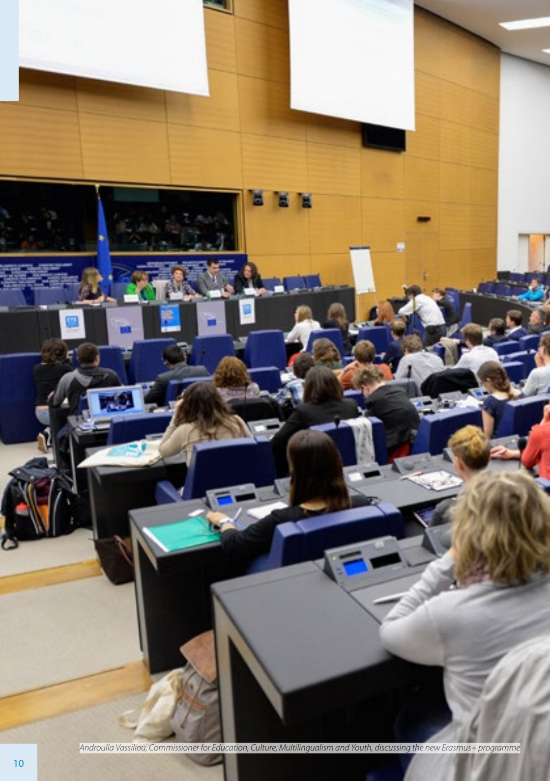
Androulla Vassiliou, Commissioner for Education, Culture, Multilingualism and Youth, discussing the new Erasmus+ programme