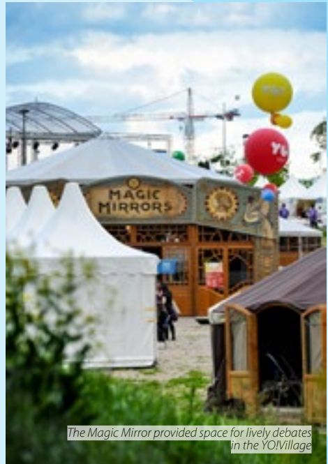
The Magic Mirror provided space for lively debates in the YO!Village

Unsustainable consumption and production patterns need to be tackled urgently. The EU has a particular duty to take action, being responsible for a disproportionate level of global consumption. Consumer education is urgently needed. Citizens need to be made better aware of their responsibilities and the consequences of over-consumption of energy and resources. In parallel, the promotion of alternatives that ensure greater efficiency and a more equitable distribution of consumption must be prioritised. Youth Organisations are a key resource in this, using non-formal education as a proven and effective tool for social change.