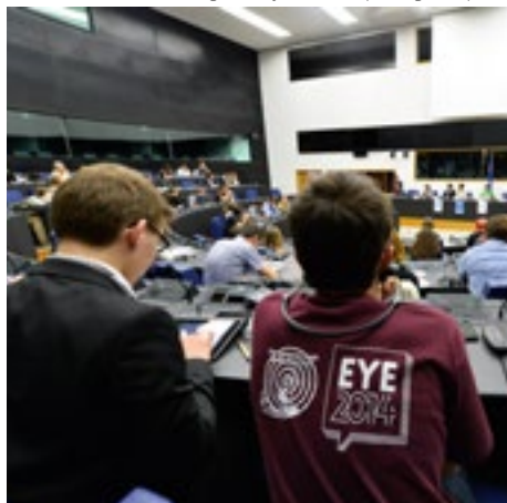
Young EYMD journalist reporting on a panel

Others believe that the solution to the skill problem is shared educational objectives across the EU, which was also supported by French Socialist MEP Catherine Trautmann stating that: