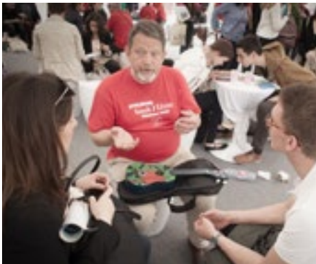
Talking about experiences of discrimination – the Living Library organised by the Council of Europe

While all of these incidents occurred outside of the European Union, Basille stressed that it is not always necessary to look outside of Europe to find human rights violations with regard to press freedom; rather, more than half of the EU countries are placed in the middle of the index.