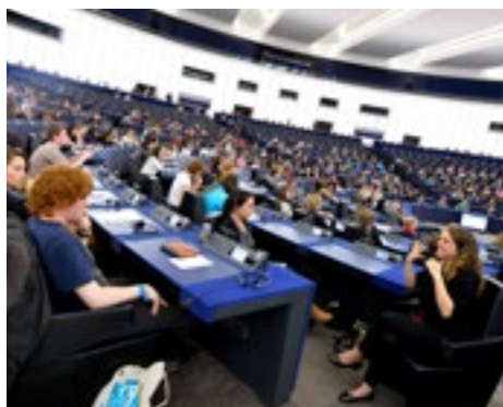
Sign interpretation at the EYE 2014

With the YO!Fest public concerts in the City of Strasbourg and Wacken, the EYE reached well beyond the 5,500 participants, enticing an additional 4,500 people to the European Parliament and the Youth Forum. The concerts provided a hook to reach out to local people in Strasbourg and the less engaged young people, and motivating a significant number to participate in other YO!Fest activities.