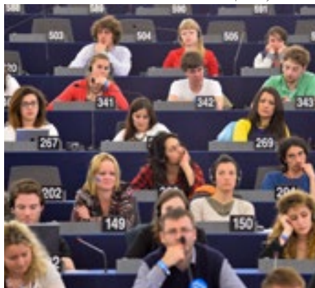
Young participants taking the seats of MEPs in the plenary chamber

people about how the EU functions, which encourages them to participate directly. Also, if you start voting when you're young, you're more likely to continue to do so when older", she said.