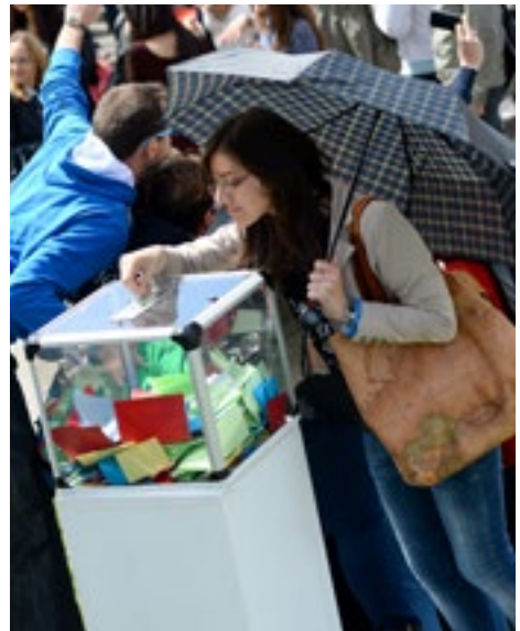
The idea box getting filled with proposals for a better Europe

In the early afternoon, as the participants started making their way home, many questions still lingered: Why did so many of the Members of Parliament cancel their attendance at the panels? Where was the President of the European Parliament, Martin Schulz? Where was the diversity of the European Union - a concept that so many of the activities touched upon, but which was not always reflected by the speakers? After three days of passionate discussion, it was clear that the young attendees wanted to engage in European politics, and while many great ideas for a better Europe were drafted by the nearly 5,500 participants over the course of the event, it is now up to the elected Members of Parliament to act on them.