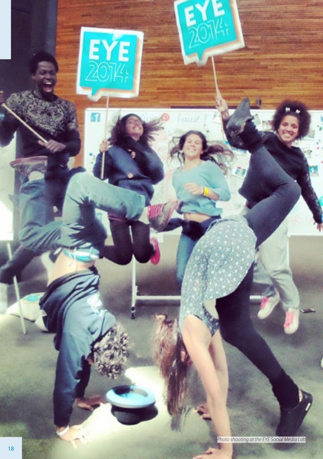
Photo shooting at the EYE Social Media Lab