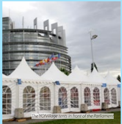
The YO!Village tents in front of the Parliament

Achieving quality youth participation is vital in order to foster a culture of responsible, proactive and democratic citizenship. Young people must be empowered and included in social, political and economic decision-making, including their meaningful participation in the formulation and implementation of development-related policies and actions. Youth organisations are an essential partner in developing sustainable youth participation processes. They must be recognised for their role in empowering young people through non-formal education and should be considered a constant partner in decision-making processes.