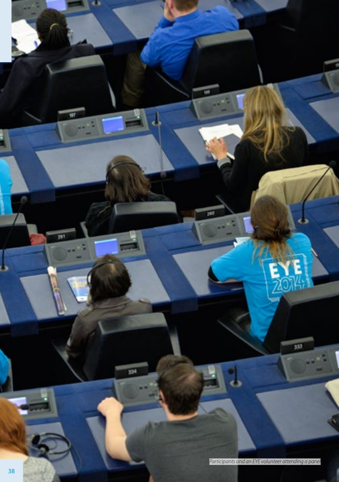
Participants and an EYE volunteer attending a panel