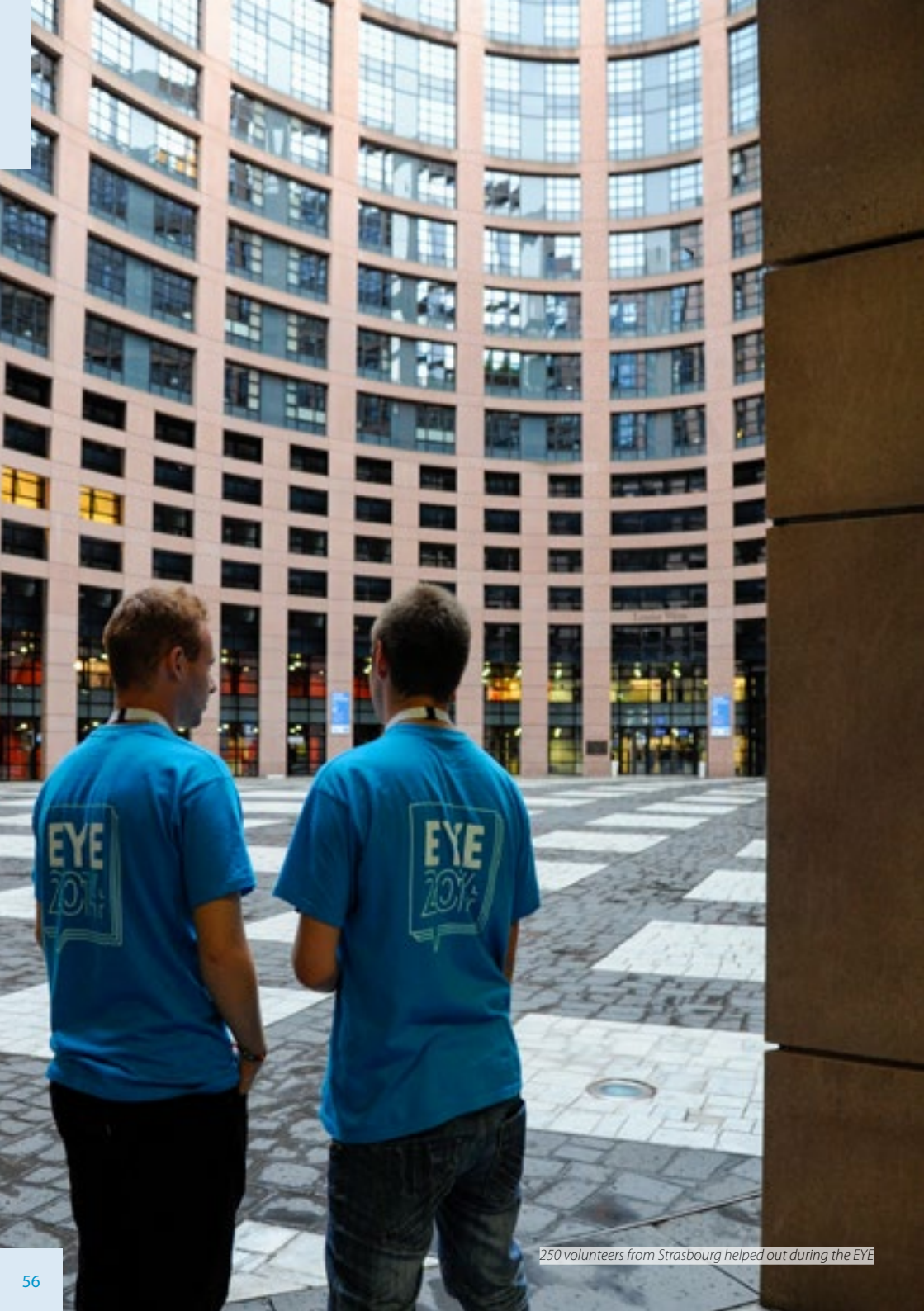
250 volunteers from Strasbourg helped out during the EYE