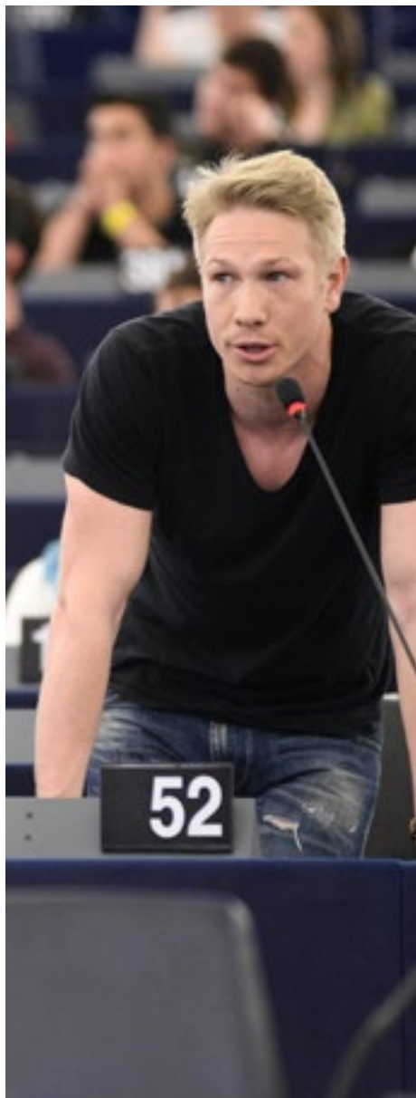
Intervention from the audience

"We need to let the future Members of Parliament know about your ideas. What they will do with them, I don't know."