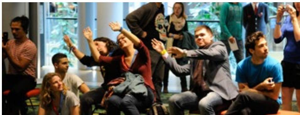
Participants watching and cheering during a spectacle in the flower bar

"Nobody knows what Europe is - it's messy, but it's nice!"