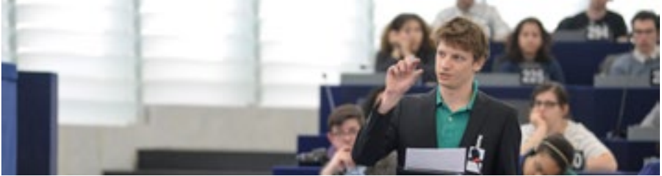
Rapporteur exposing ideas from EYE panels at the closing plenary

While it may seem odd to associate these topics with the concept of a unified European identity, reading between the lines offers some insights: