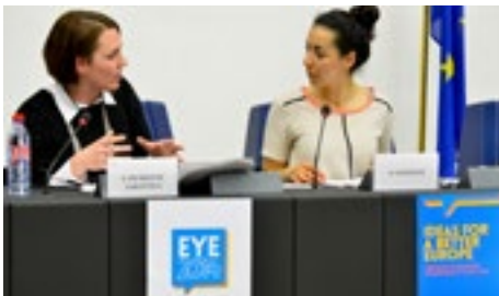
Young MEPs discussing with participants the «smart cities» of their dreams

In order for this to happen, however, issues of equal access and education have to be dealt with.