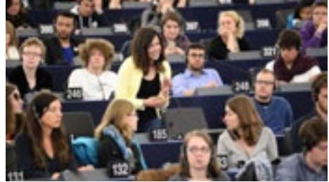
Taking the floor during a session

a study in the UK showed that such cameras have little impact on the overall crime rate.