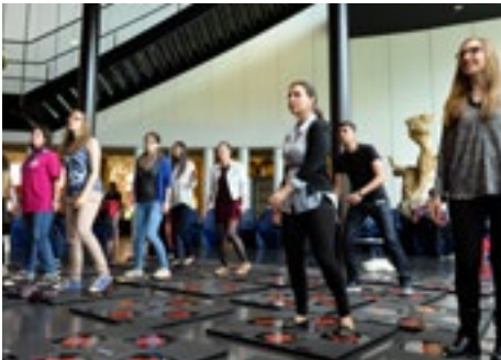
Participants experiencing how technology and fitness can go along with the iDance Machine

Cyber criminality has, without a doubt, changed the law; not only on the level of nation-states, but also in terms of Europe itself. Consequently, it is not surprising to find great interest in problematic cases that have been dealt with by the European Court of Human Rights and the Court of Justice of the European Union.