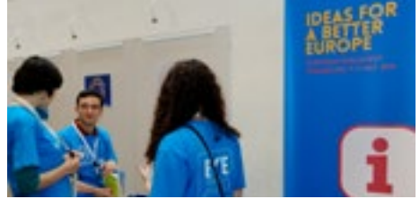
Three EYE volunteers in one of the many helpdesks around the Parliament