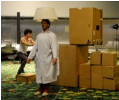
Another glimpse of the circus show in the flower bar

In a panel discussion on the future of sustainable fishing, participants noted the recent achievements of the EU with regard to legislative changes, but also the great challenges involved in implementation and achieving a common EU policy, in spite of the fact that some countries are much more affected than others. The participants criticised the strong lobbying which recently led to the rejection of a phase-out of destructive deep-sea bottom trawling by a thin majority in the Parliament, and it was felt that the issue should be put on the agenda again. Moreover, many participants, in particular those of southern European origin, called for more incentives and support for fishermen in their countries, in order to, for example, earn a living with fishing tourism. They felt that the quotas and excessive EU regulation negatively affect their communities. Panellists and participants alike suggested greater flexibility with regard to quotas so that less fish is thrown back into the sea, and for incentives for a diversification of the European diet towards other fish species.